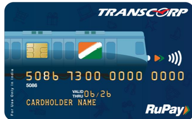
NCMC Contactless Card